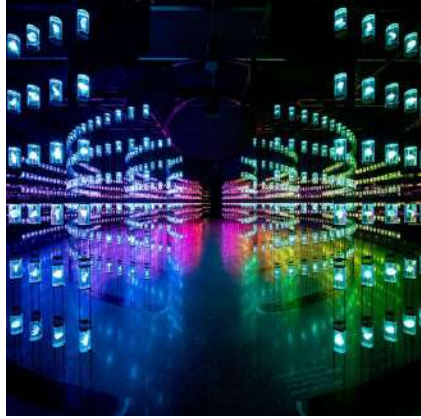
Culture Guide: Spring 2023