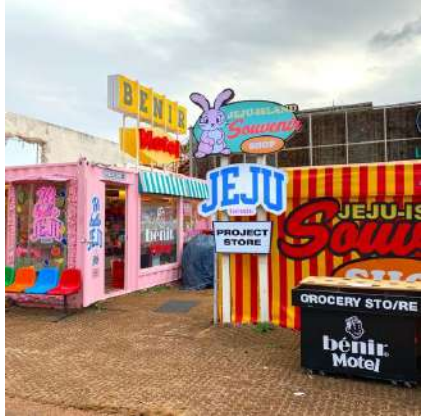
Cities to Watch 2023