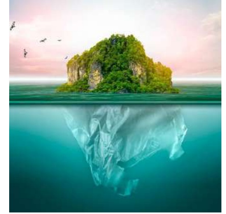
Sustainable Cities: Global Guide